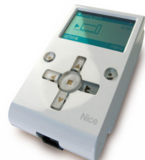
O-View programmer is used by the installer to advance features and fine tune motor functions.