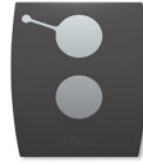
ON2 Transmitter 433.92 MHz, 2 channel