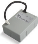
PS124 24 V battery with integrated battery charger.