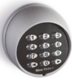
MOTXR Wireless keypad