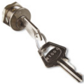
CM-B Metal release key and cylinder