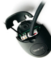
OX2 Pre-wired receiver card for control of Garage doors and external devices