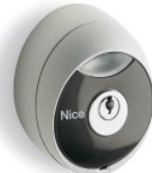
MOSE Key selector switch for outdoor installation