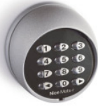
MOTXR Wireless keypad