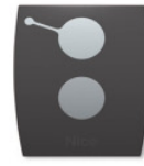
ON2 Transmitter 433.92 MHz 2 channel