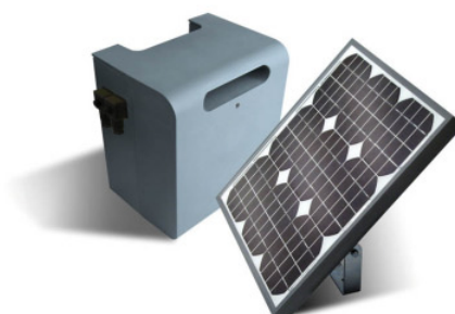
Solemyo solar kit

The innovative Opera system enables the installer to manage, program and control automation systems, also remotely, simply and safely, with significant savings in time.