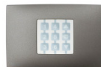
OPLA Wireless wall button for multiple functions