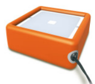
GO Mini Cover for Nice way transmitter