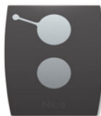
ON2 Transmitter 433.92 MHz, 2 channel