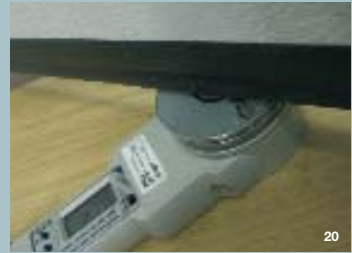
20 Impact toughness test on sectional door

The impact toughness test is one of the tests performed in Nice laboratory to ascertain the action of the force limiting system.