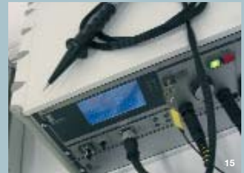
6 Incandescent wire test on MoonLight