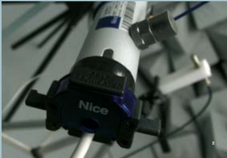
2 Acoustic chamber test on tubular motor vibrations