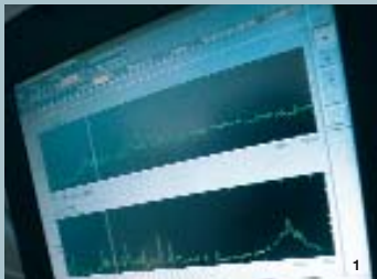
1 Acoustic chamber test – graph of external PC interfaced with the chamber